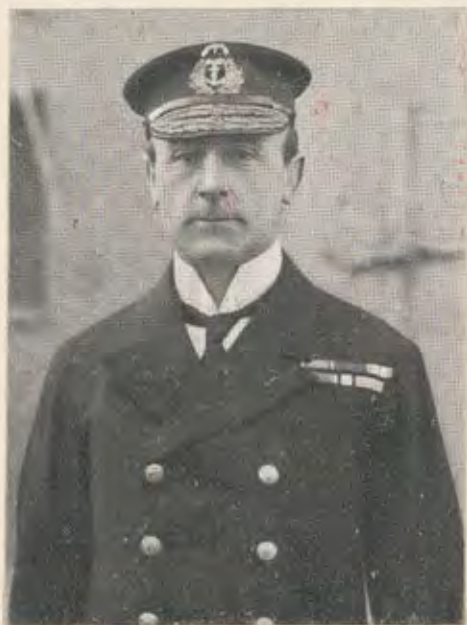
ADMIRAL SIR JOHN JELlicOE.