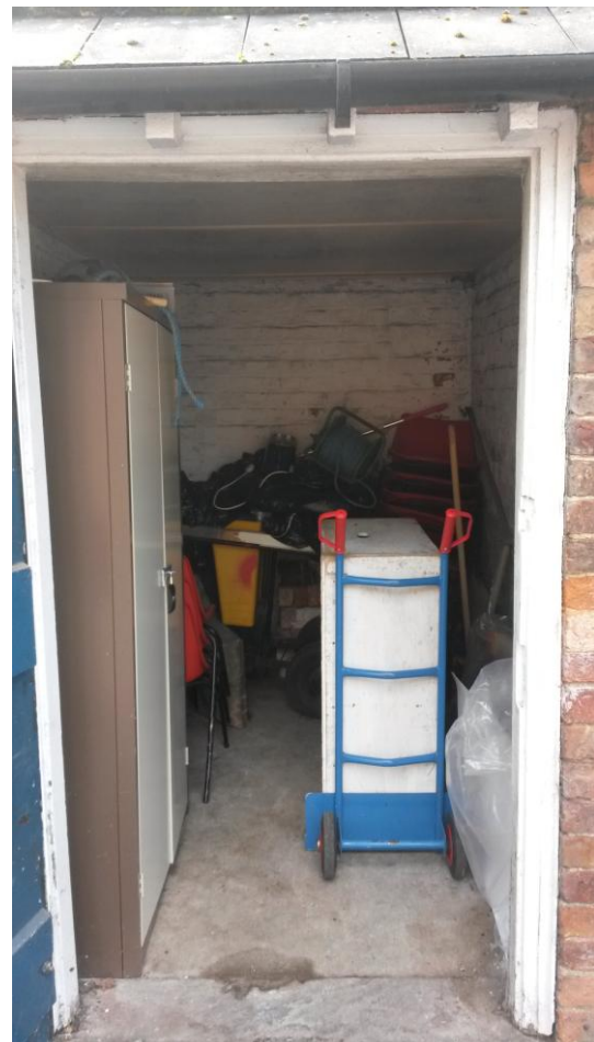
1: Wigginton Parish Council outbuilding before conversion work